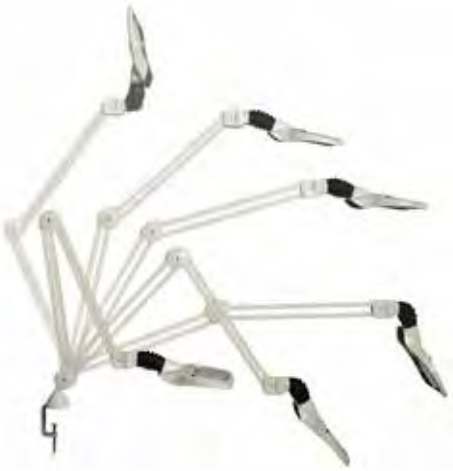
Self-balancing, friction-free arm.

The flexibility of the self-balancing arm and friction-free joint between the lamp head and arm makes exact positioning easy.