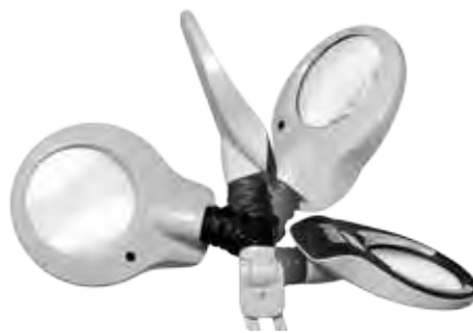
Friction-free joint between the lamp head and arm.