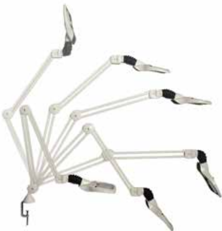
Self-balancing, friction-free arm.

The flexibility of the self-balancing arm and friction-free joint between the lamp head and arm makes exact positioning easy.