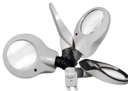
Friction-free joint between the lamp head and arm.